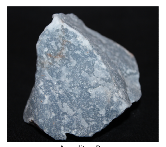
Angelite- Peru Coming in June

The featured mineral in June will be will be the angelite gemstone variety of anhydrite that is only found in Peru. This mineral's color has a range of delicate blues that are often prized for use in jewelry and carvings. It is the anhydrous form of calcium sulfate that we are sure will peak your interest and enhance your collection.